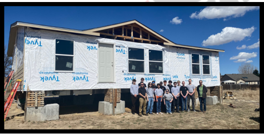
HOUSE BUILD 2023-24