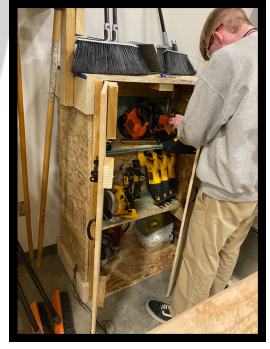
EQUIPMENT CHECK OUT - CONSTRUCTION CLASS